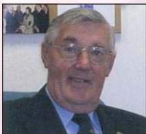
President D Kennedy